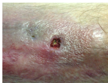
Fig. 2. Wound after five days of using NPWT.