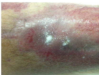
Fig. 4. Using of Altrazeal®.