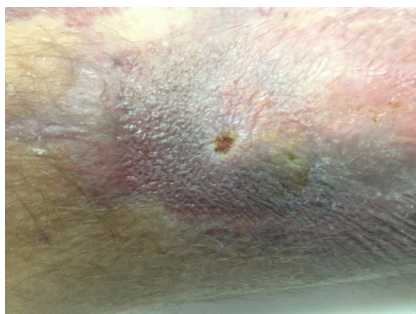
Fig. 3. Wound after ten days of using NPWT.