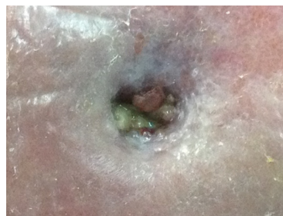
Fig. 1. Initial wound presentation.